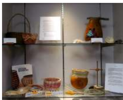
Sue Round Reed Grace Gourds