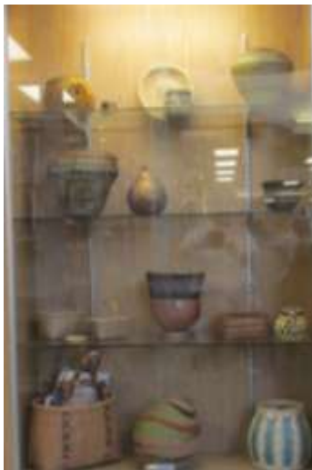
Venice Public Library August 2013