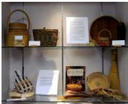
Donna Flat Reed Vicky Naturals