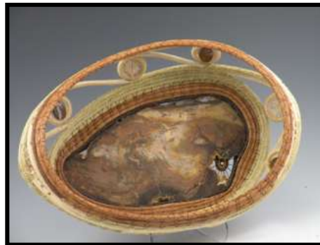
“Trees Have Soul” Muhly Grass, pine needles, petrified wood, Teneriffe rounds, Perersite pendants, Jasper beads 15 x 10 x 4 inches Kathryn Erickson