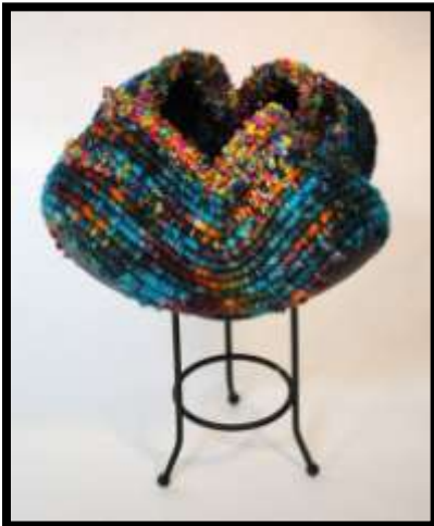
“Primary Fusion” Gourd Base with coiled yarn 10” x 10” x 10” Elaine Cunningham