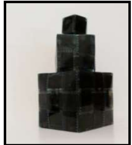
“Box Office Hits” 35 mm film Double Sided permanent tape 3 cubes: 4” x 2 1/2 “ x 1 3/4” Sue Davis